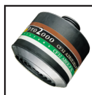
042799/DT-4045E DT-Series (Pro2000) CF32 B1E1K1P3