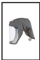
S-333 PAPER P3

Headtop/Facepiece, Hose and Filter Options