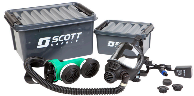
PF-600E-ASB (Proflow SC160) Ready-Pak in tub with 3M FF-300 (Promask Single/FM3) Full Facepiece & pair of P3 particle filters. P/N UU011534359 (5064594)