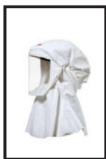
S-533 PAPER P3