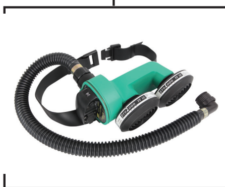
PF-600E-ASB (PROFLOW SC160) UU011535406 (064580)

must be add to PF-600E-ASB (Proflow SC160) to use FH1, FH2, FH21, S-333 and S-533, M-200 and M-300