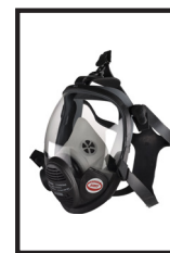
FF-600 (Vision RFF4000/ FM4) Full Facepiece PAPER P3

ADP-03 UU011003157 Adaptor to use with S- and M-Series Headtop