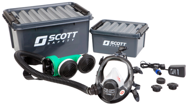
PF-600E-ASB (Proflow SC160) Ready-Pak in tub with FF-600 (Vision RFF4000/FM4) Full Facepiece & pair of P3 particle filters. P/N UU011534383 (5564593)

The 3M PF-600E-ASB (Proflow SC160) Ready-Paks, provides a “ready-to-go” system containing all you need to get started. The kit includes the PF-600E-ASB (Proflow SC160) PAPR unit, PVC belt, EPDM hose, battery, recharger, a pair of DT-Series (Pro2000) particle filters and a choice of headtops; 3M FF-300 (Promask Single/FM3) Full Facepiece and VFF-600 (Vision RFF4000/FM4) Full Facepiece. Ready-Paks are certified to AS/NZS 1716:2012.