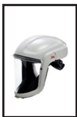
M-200 PAPER P3