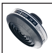
052670/DT-1135E DT-Series (Pro2000) PF 10 P3