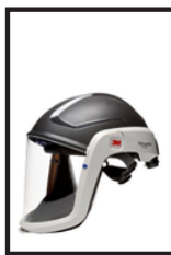
M-300 PAPER P3