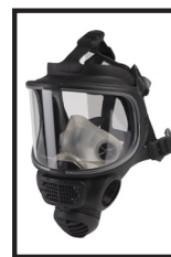
3M FF-300 (Promask Single/ FM3) Full Facepiece PAPER P3